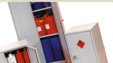
Liquid Cabinets/Bin 144