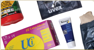
PPE Equipment 139