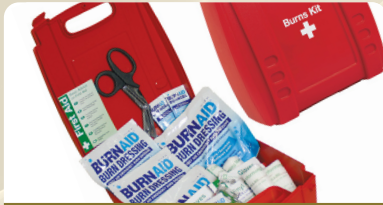
Burns Kits 141