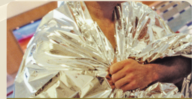
Evacuation Blanket 142