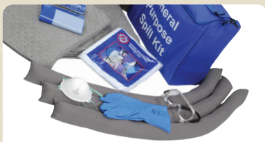
Spill Kits 143