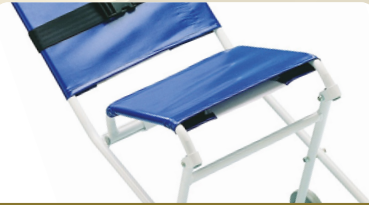
Transit Chair 141