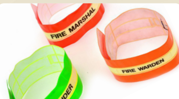
High Visibility Armbands 143