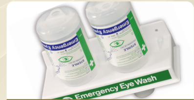
Eyewash Stations 140