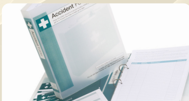
Accident Book & Holder 142