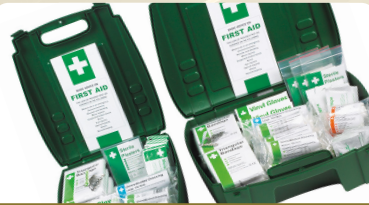
First Aid Kits & Cabinets 139 - 140