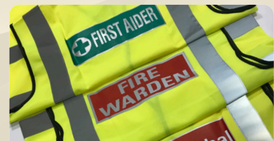
High Visibility Waistcoats 143